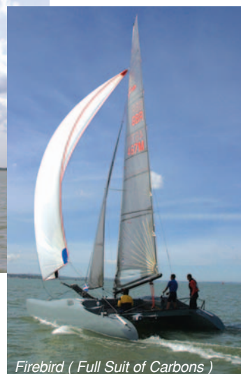
Firebird ( Full Suit of Carbons )