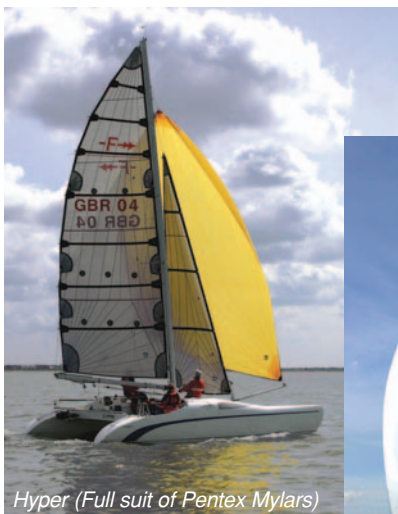
Hyper (Full suit of Pentex Mylars)